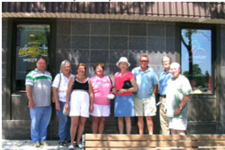
Club members after Sunday Breakfast