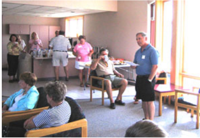
LMYA Breakfast Meeting